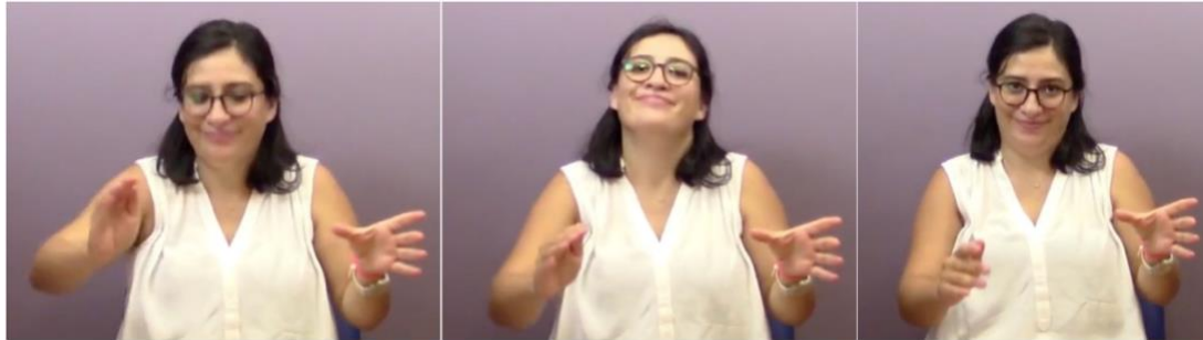
Figure 2. Head nod occurring at the end of the sentence in TİD