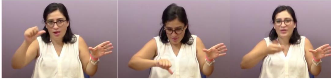
Figure 1. Head nod occurring after a clause in TİD